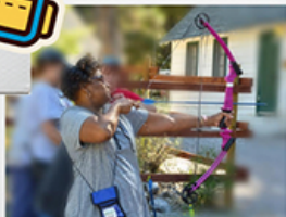
learning archery was so much fun!